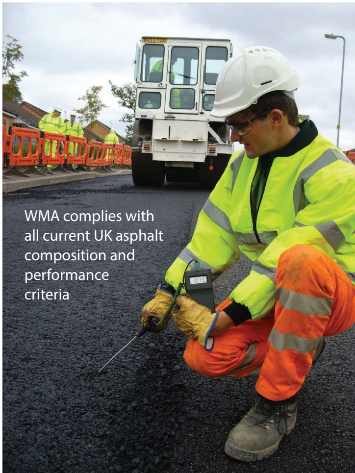
WMA complies with all current UK asphalt composition and performance criteria

Nevertheless, there are many sites across both the Strategic Road Network (SRN) – managed by Highways England and on the local road network where WMA has been trialled and used successfully. Some authorities routinely specify the material and Highways England will allow its use subject to successful departure from standard application and approval.